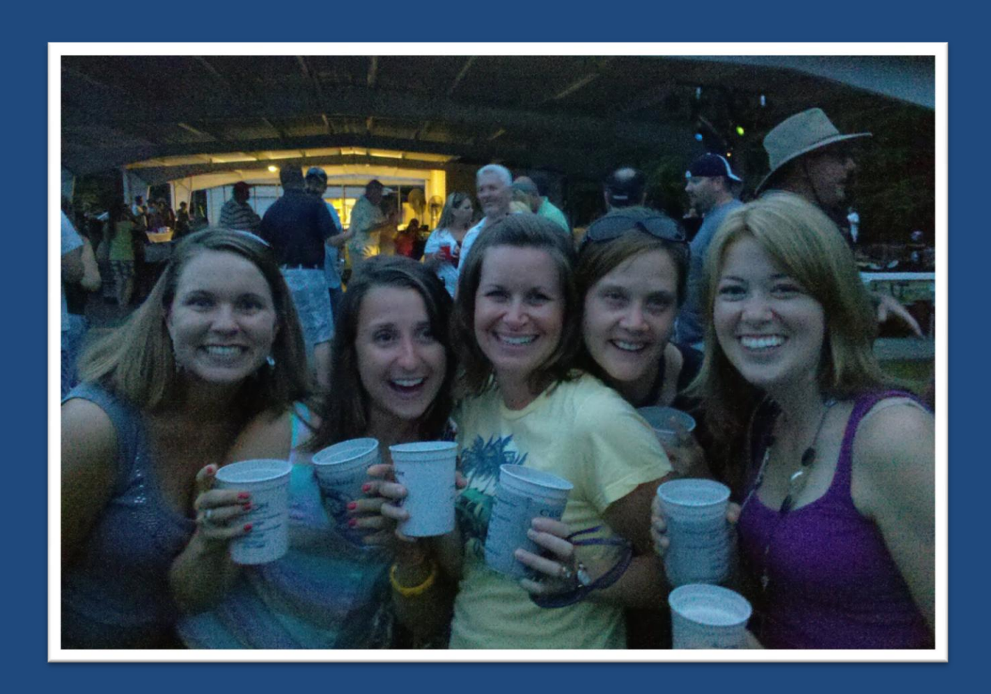
Having Fun – Doing Whatever You Want