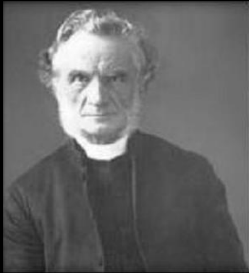
Brooke Foss Westcott