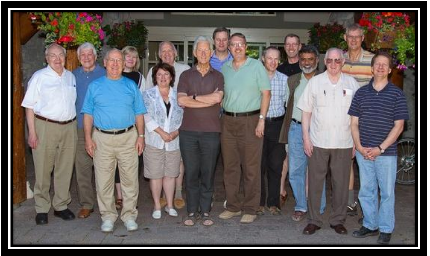
Committee on Bible Translation, July 2010, after finishing the revised NIV (2011).