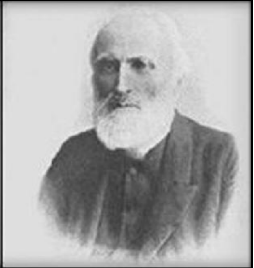
Fenton John Anthony Hort